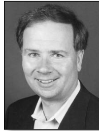
Jim Knoblach R-St. Cloud